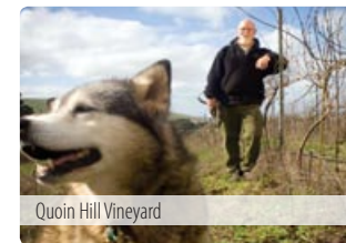
Quoin Hill Vineyard