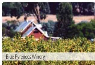
Blue Pyrenees Winery